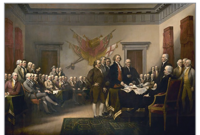
Top: Higgins House getting a new roof (2020). Bottom L: Higgins House can be seen on far right built into larger home (1988). Bottom R: One year before Moorfield was founded, Declaration of Independence was signed (J. Trumbull painting)

900 square feet of exhibition space within the House so how are we going to fit in a museum and offer a world view as seen through a local lens? First, we are committed to protecting the integrity of the historic structure. Electricity for lighting and HVAC will be added, as inconspicuously as possible. Interpretive panels will tell the story and displays will present related historical objects.