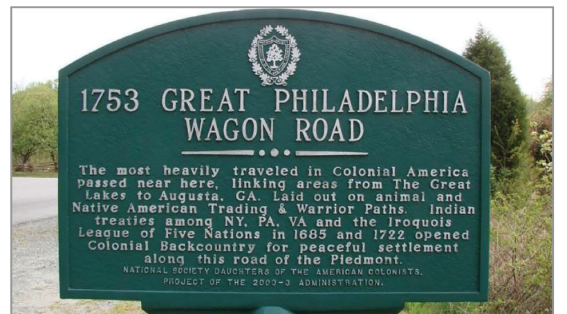
Colonial settlers followed the frontier road south and into the west building log cabins along the way.

The West Virginia Humanities Council is honored to support the Hardy County Convention and Visitors Bureau in their efforts to restore the Robert Higgins House for use as a visitor's center and museum. Pres-